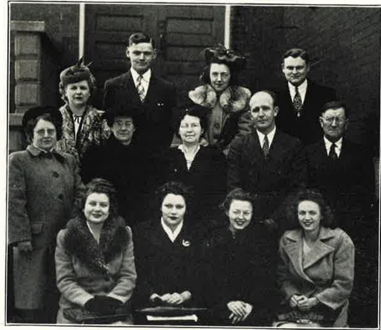
The Teachers and Officers

Their current church expense obligation are payments made toward the fuel bills.