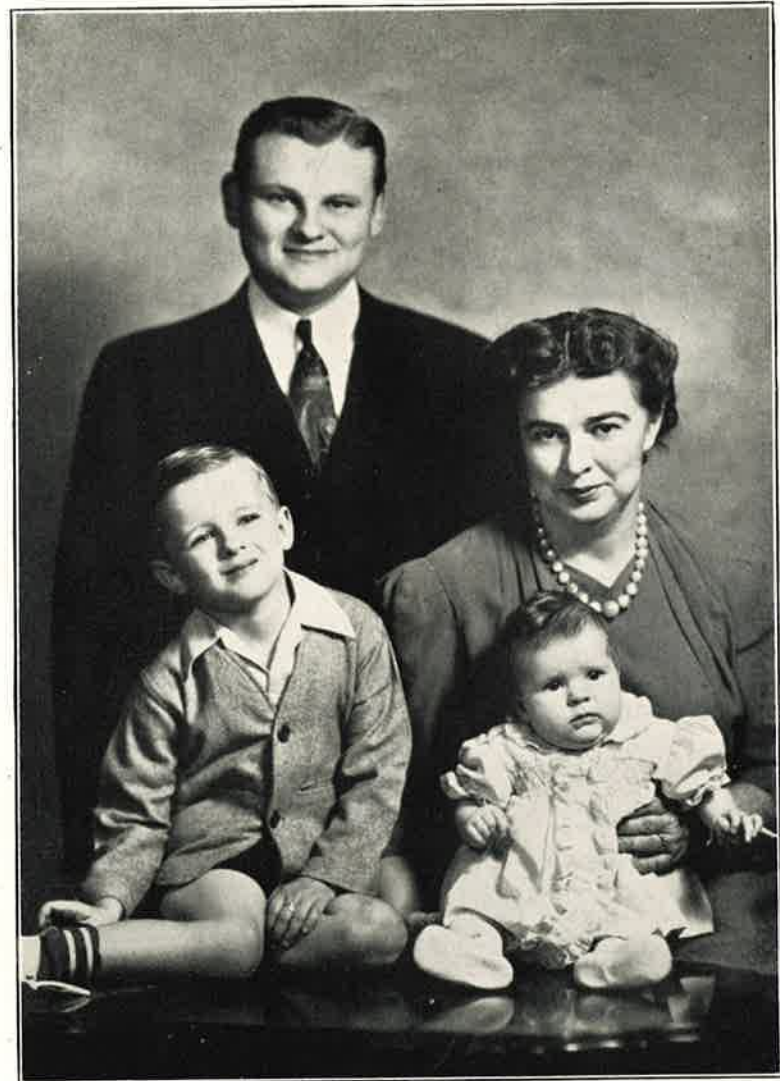
The Pastor and His Family—Minister since June, 1936