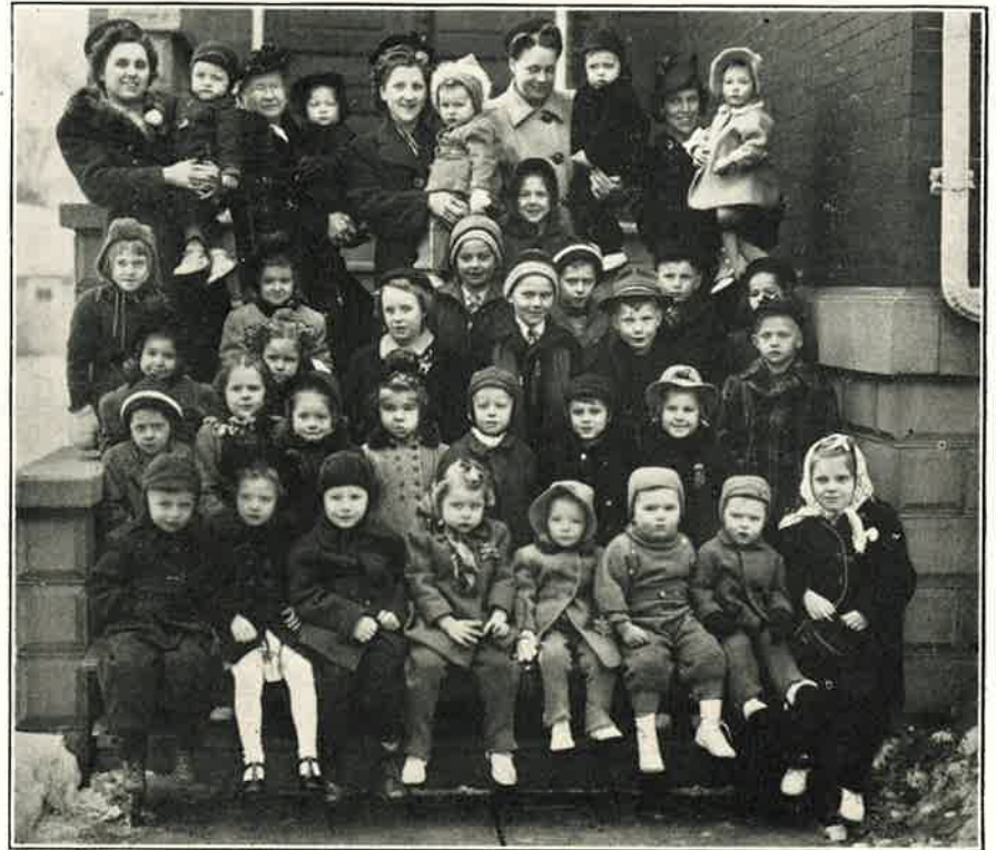
Primary and Beginners