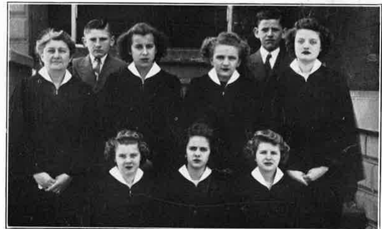
The Junior Choir (a few of this group absent)