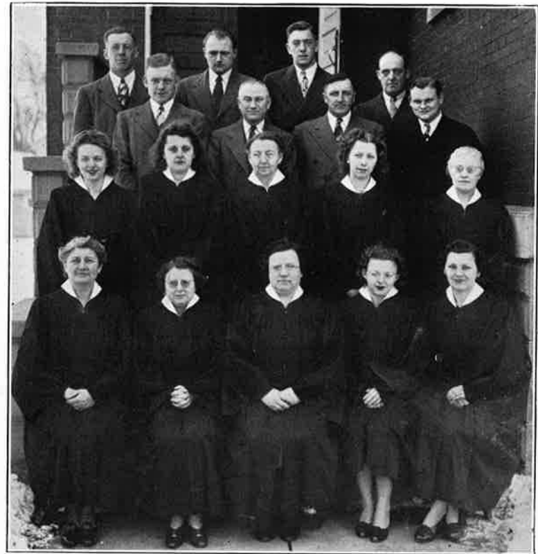
The Senior Choir and the Men's Chorus