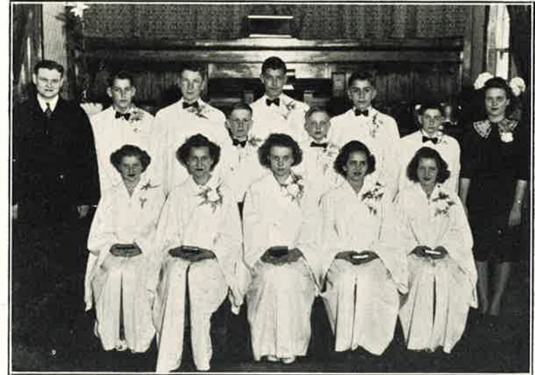
The Anniversary Confirmation Class of 1945

Twelve potential disciples of the Christ.