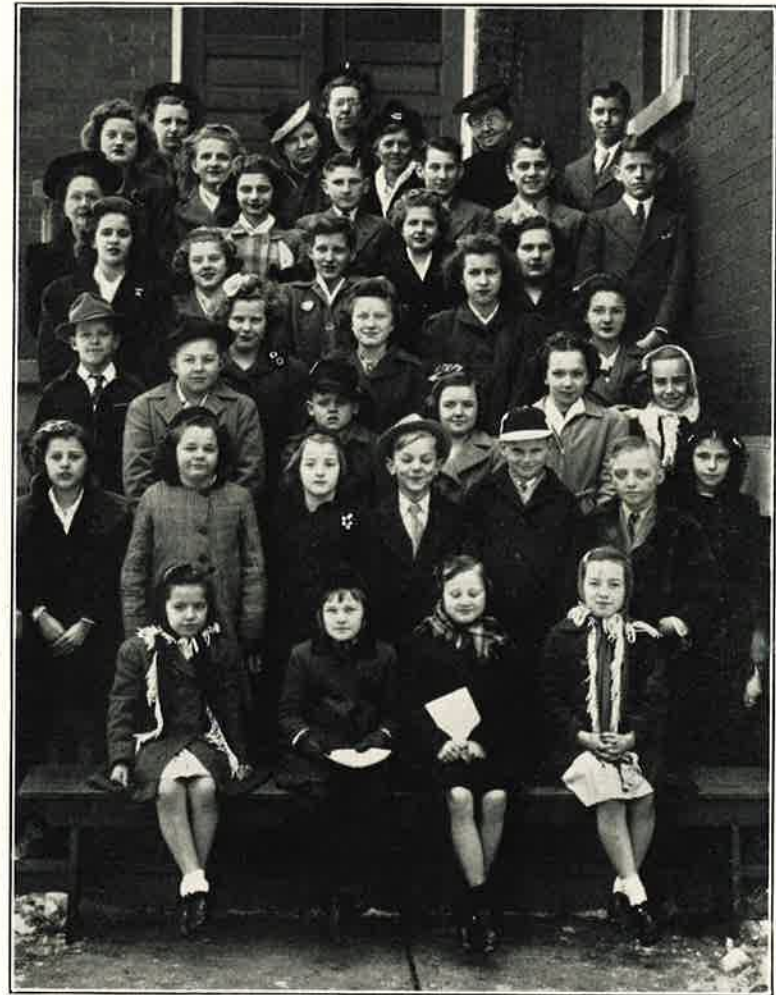
Juniors, Intermediates, Young People, and Adult Departments