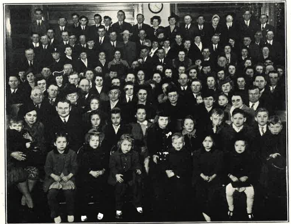
The Congregation Remaining on Sunday, January the 28th, 1945

How impoverished would our worship services be without music's universal language displayed in congregational hymns!