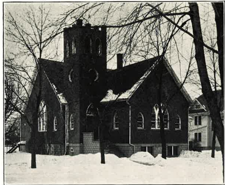
The Present Church Building—Dedicated March 2nd, 1913