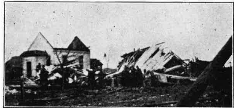
The Old Church Destroyed by Cyclone, April the 21st, 1912