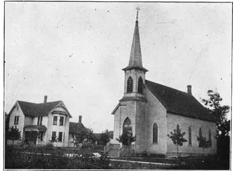
The First Church and Parsonage