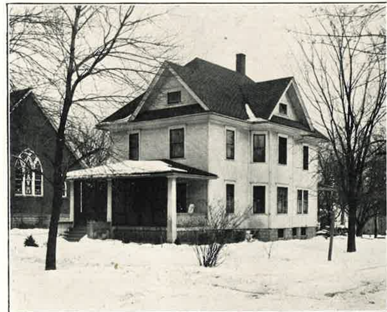
The Parsonage—a fully modern ten-room dwelling.