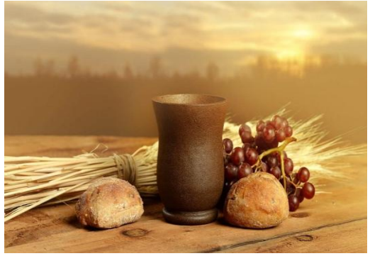
Table #1 (Italy) Breads: Asiago Focaccia and Black Pepper. Wine: Bella Bolle (Pink Moscato)

Are you wondering what breads and wine to try this morning? As you pass by the tables from left to right, the following countries, along with their bread/wine, will be represented: