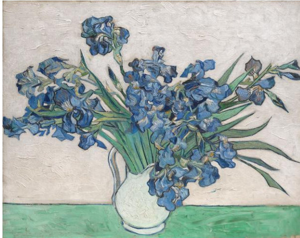
Figure 1 - Irises (Van Gogh)

Sunday School – 9:00 a.m. Sunday Morning Worship – 10:30 a.m. Church Office – (815) 465-6191 Parsonage phone – (815) 466-4048 Pastor's Cell – (567) 249-5130 Website: www.stpetersgp.org Email: stpetersgp@sbcglobal.net Facebook: St. Peters UCC Grant Park